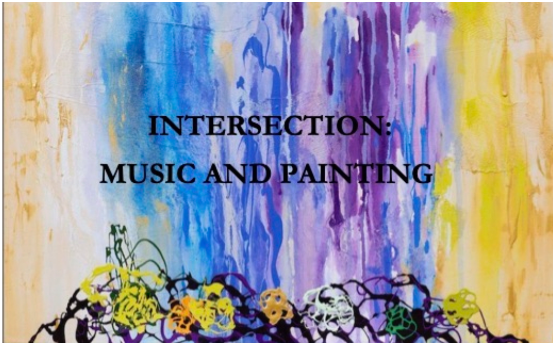
"IN BETWEEN" (from the VEILS Series) Enamel paint with collage elements on canvas by Serena Bocchino