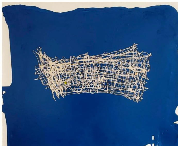
"Mind Float", Enamel paint on canvas, 28" x 34", 2006