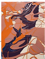
Detail of "Moving Forward"

RECEPTION FOR THE ARTIST IS MARCH 9th- 5-7 PM. SHOW RUNS UNTIL APRIL 6th