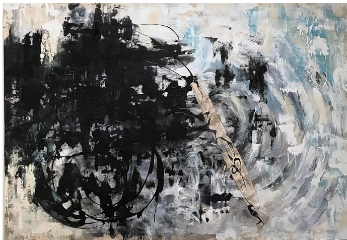
"Swoosh", Enamel paint with collage element, 48" x 68", 2018

In the painting "Swoosh", there is a maelstrom of black strokes that looks as if it was painted in a fury. The soft white swirl of layered background contrasts with the black mass giving the piece its initial punch. But as you look closer, the energy is tempered with a piece of canvas strip that harnesses the activity, creating a wonderful juxtaposition.