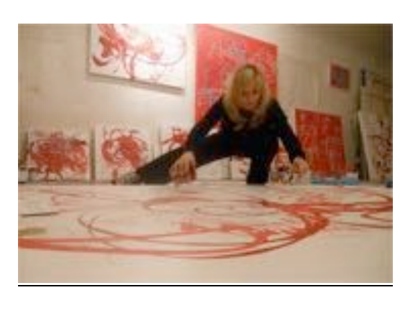
For Immediate Release